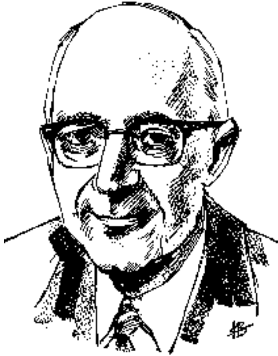
Gordon W. Allport