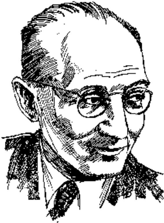
Kurt Lewin 1890-1947

MIT-Research Center for Group Dynamics “A Dynamic Theory of Personality” ©1935